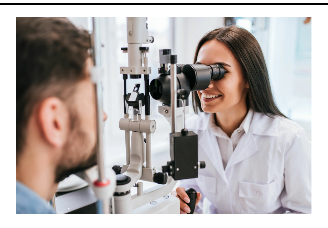
Fed Health Centers Poised to Expand Eye Care, Lose Funding