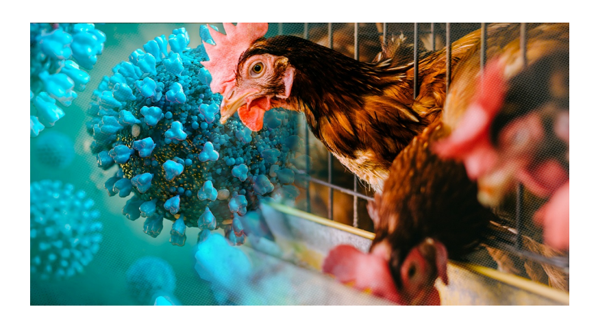
Bird Flu Found in Live Poultry Market in N.J. Marking First Domestic Case