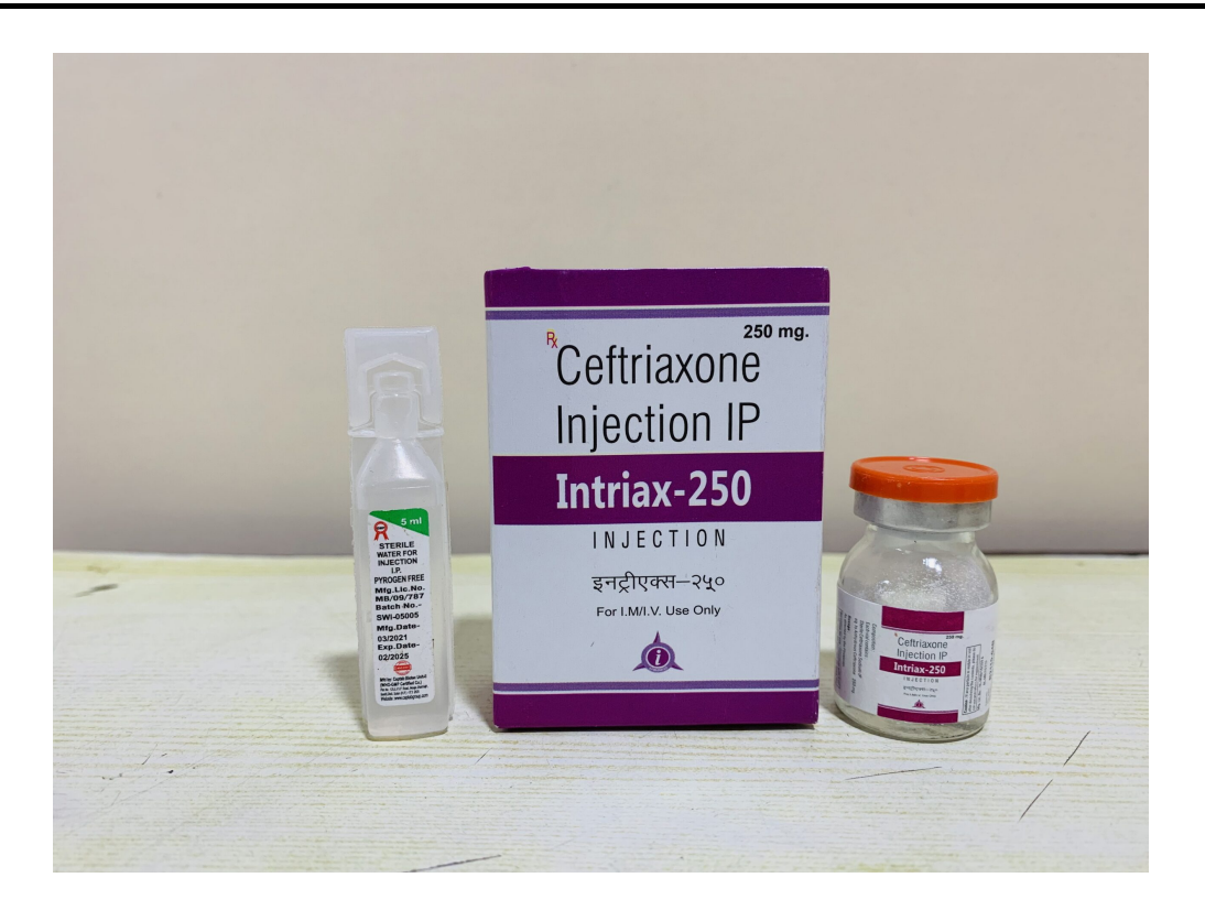
Call for Cases: Serious Adverse Events after Ceftriaxone Administration