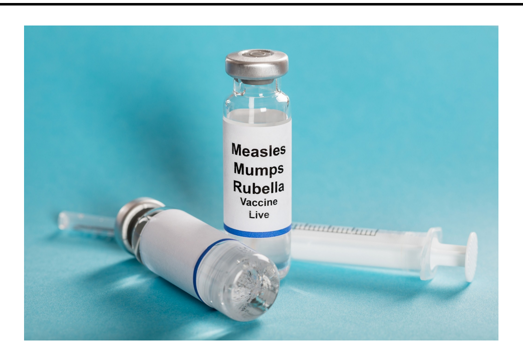
Confirmed Case of Measles, Bergen County, NJ February 2025